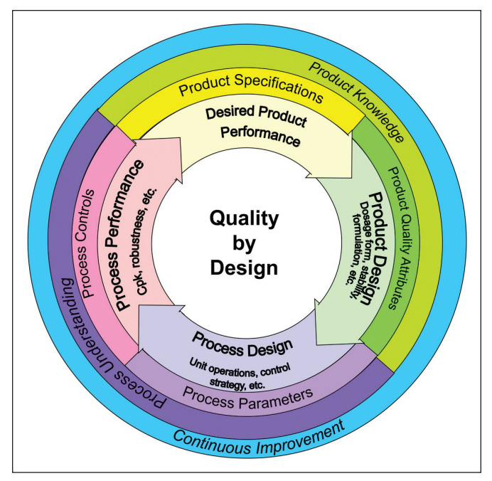
Figure 2. Quality by Design is a cycle in which product and process design and performance create a closed loop of knowledge and continuous improvement (source: FDA's view on QbD, Moheb Nasr, 2006).

Figure 3a shows the struggle most companies have to achieve QbD or any lifecycle approach. The separate information environments means that the various teams often cannot