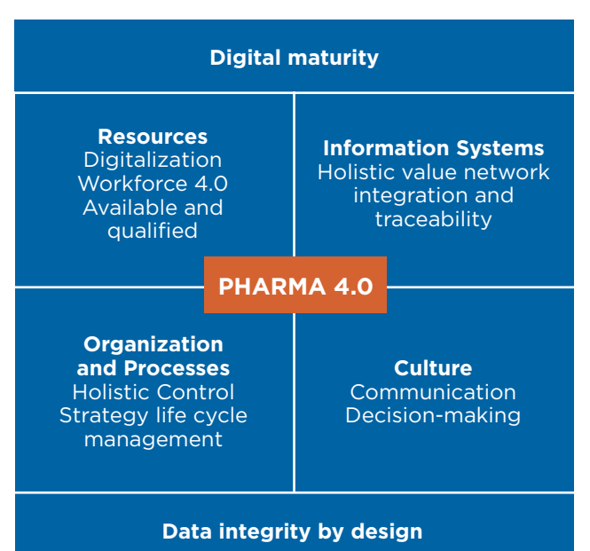
FIGURE 1: PHARMA 4.0

Transforming current pharmaceutical manufacturing to Pharma 4.0 requires a new approach to manufacturing and process data capture. Big data provides a practical solution that does not require complicated integrated models and permits the use of cloud-based advanced analytical techniques for artificial intelligence. With enough information and quality content, these technologies can transform data into knowledge that supports critical activities, including process optimization, continuous improvement, operational excellence, and